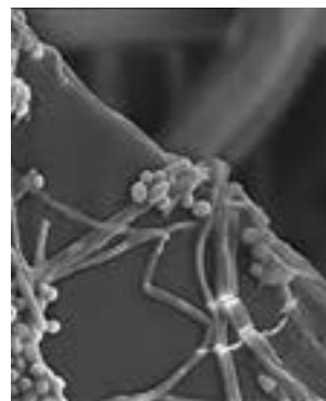
Untreated surface after exposure to Candida albicans